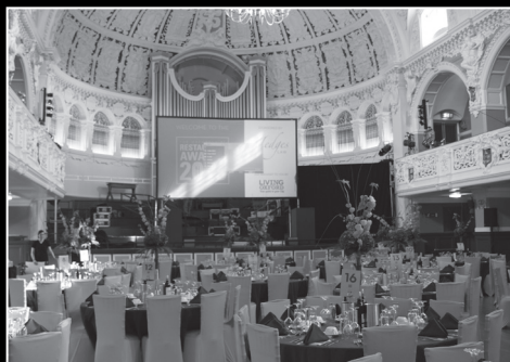
2015 Oxfordshire Restaurant Awards at Oxford Town Hall

Ever since we launched Living in Oxford Magazine in 2002 and the Oxfordshire Restaurant Guide in 2001, the support we have received from Oxfordshire restaurants has been excellent.